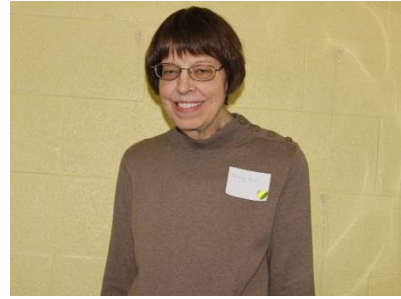
Monty Aron Program Resource