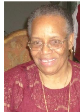
Iris Green Communications